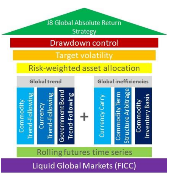
Figure 1: Illustration of the J8 Global Absolute Return Strategy (J8 GARS) construction

J8 GARS employs a multi-strategy systematic investment process to benefit from both directional trending opportunities and structural market inefficiencies. The program marries trendfollowing with other strategies to capture market inefficiencies within a multi-strategy construct. Strict risk management protocols are further applied to generate persistent returns.